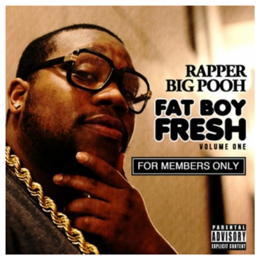
Ahhh, yeeeuh. Dissuz a tite chin pose, to be honess wit Pooh.