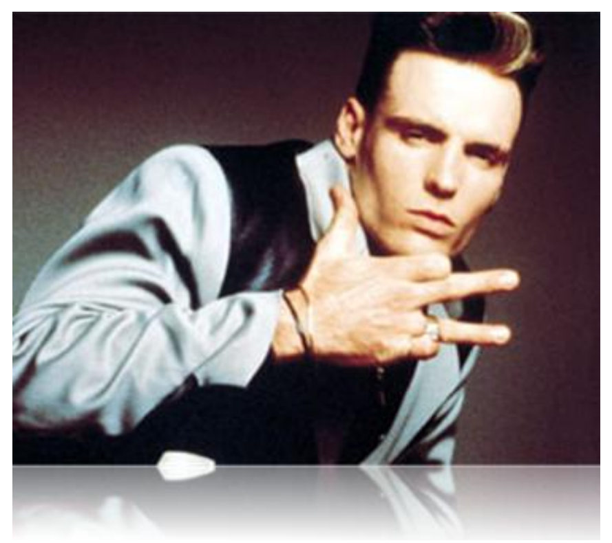
Wussup, muh 'Nilla? To be ahhness wichoo, not much these days. Word to yuh mu-thuh.